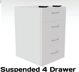
Suspended 4 Drawer

The overall sizes of the carcasses are 700mm High x 450mm Wide x 500mm Deep. Each unit weighs approximately 50kg, this has to be taken into account when loading the table.