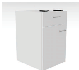
Suspended Drawer & Cupboard