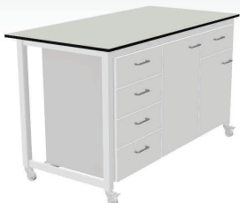
Mobile Table with 3 No units

Each table is able to support up to 3 storage units. Units can be purchased at the same time as the tables or they can be easily installed into an existing bench from the Fusion Range at a later date.