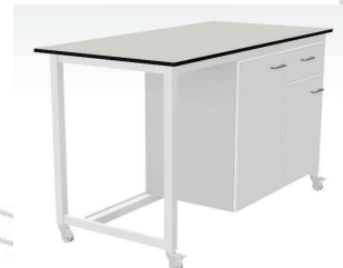
Mobile Table with 2 No units

Each table is able to support up to 3 storage units. Units can be purchased at the same time as the tables or they can be easily installed into an existing bench from the Fusion Range at a later date.