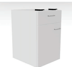
Suspended Drawer & Cupboard

The under bench storage units are manufactured from Melamine Faced MDF. The carcasses are manufactured using mitred joints and fully grooved in backs making for a long lasting and durable unit. All seen edges sealed with 1mm thick ABS lipping. The drawers and doors are also manufactured from Melamine faced MDF. All seen edges are sealed with 2mm thick ABS lipping's and come complete with a stainless steel 'D' Pull style handles.