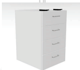
Suspended 4 Drawer